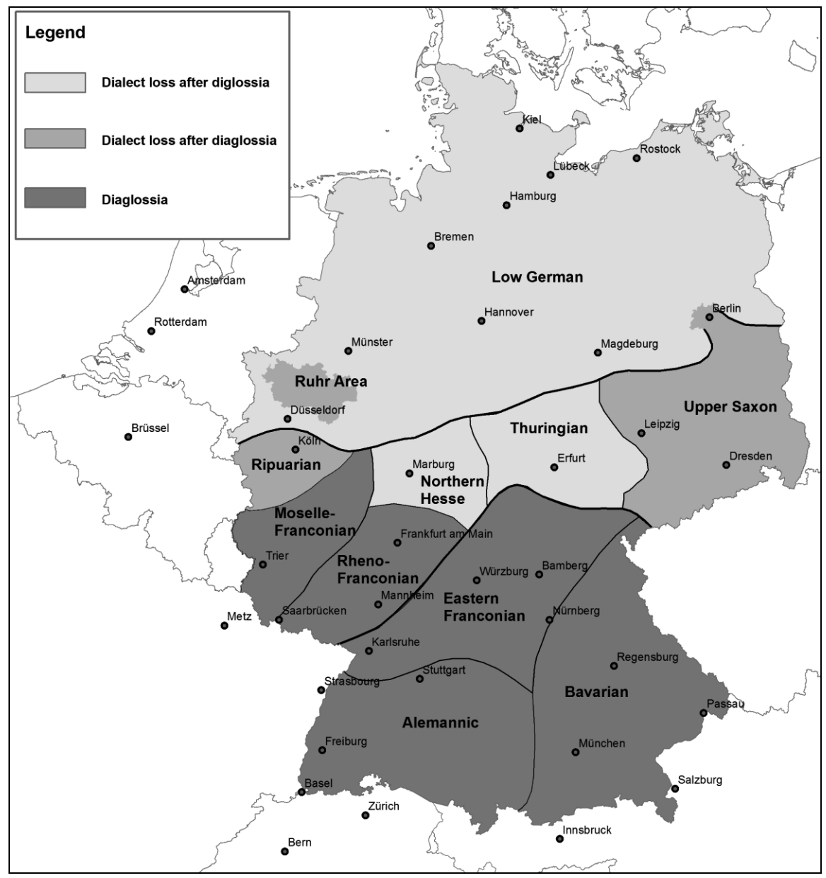
Figure 2: Generalised map of dialect-standard constellations of today's Germany (red. Stoeckle)

The large cities merely have an indirect linguistic influence: They function as a model for regional identification and thus strengthen the linguistic self-confidence of their related dialect areas (Munich for the central Bavarian, Stuttgart for the Swabian, Nuremberg for the Franconian, etc.). Ruoff (1997: 143) states that dialects in the south of Germany are changing, but that this change does not appear to be in the direction of the standard language.